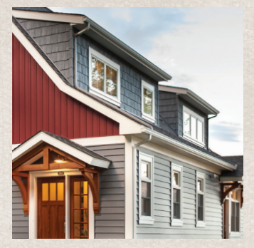
Vinyl Siding and Accent Panels

*Consult the VSI Website at vinylsiding.org for current list of certified products and colors.