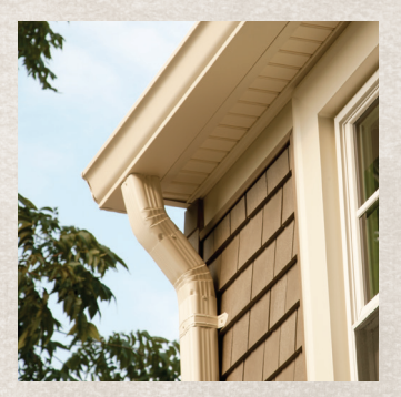
Rainware, Fascia, and Soffit