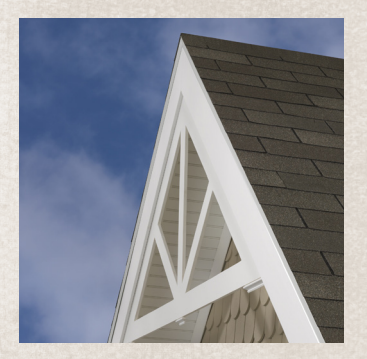
Ply Gem Trim and Mouldings