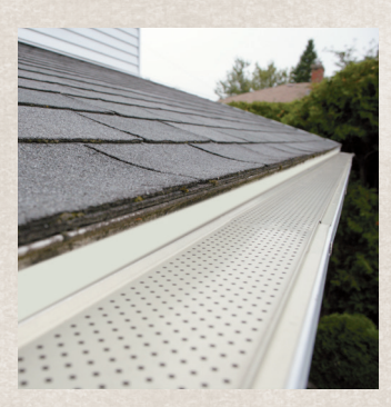
Ply Gem Gutter Protection