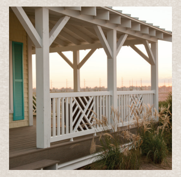
Ply Gem Fence and Railing