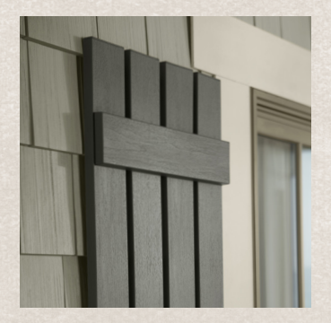
Ply Gem Shutters and Accents