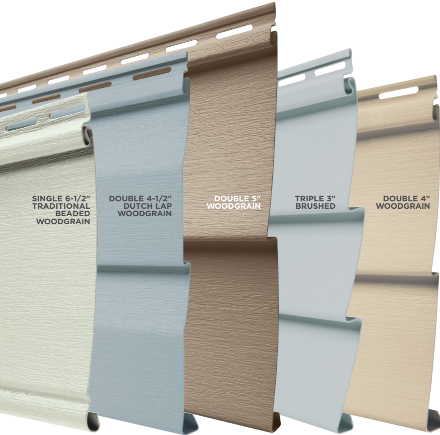
SINGLE 6-1/2" TRADITIONAL BEADED WOODGRAIN