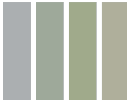
Flint Irish Thistle Southern Cypress Stone Mountain Clay